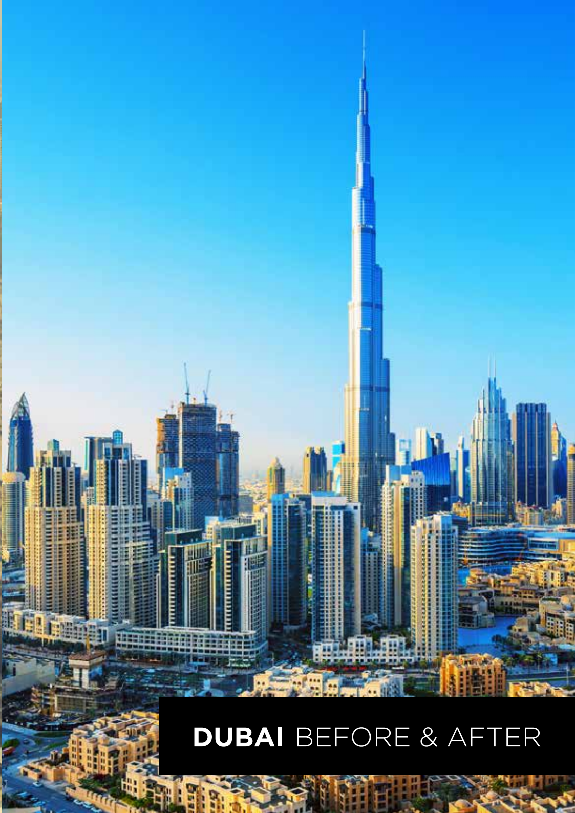
DUBAI BEFORE & AFTER